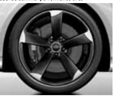
Audi S line® Competition package, Coupe only