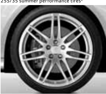
Audi S line® package