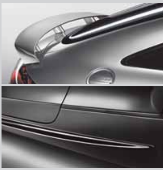
Rear Deck Spoiler

Add a "twist" to turn heads at every turn. Audi Genuine Alloy Wheels are designed with style and longevity in mind. Shown in white. Also available in black or silver.