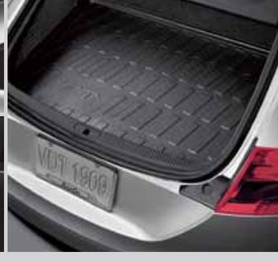
All-weather Trunk Liner

These sculptured accents provide the TT profile with a ground-effects flair. Not available for TTS and TTRS.