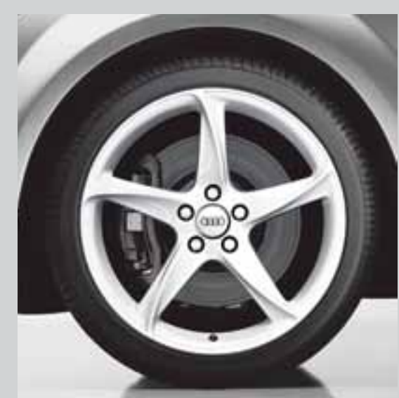
19" Turbo Twist Wheels-White

who designed your vehicle, all accessories feature a tailored fit and the expert craftsmanship you'd expect from Audi. They are also backed by the 4-year/50,000-mile Audi New Vehicle Limited Warranty, or the accessory's 12-month/12,000-mile limited warranty, whichever extends longer from the accessory purchase date.<sup>1</sup>