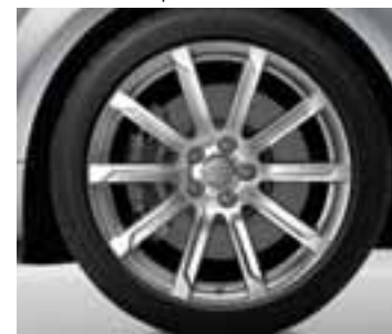
Premium Plus, Prestige