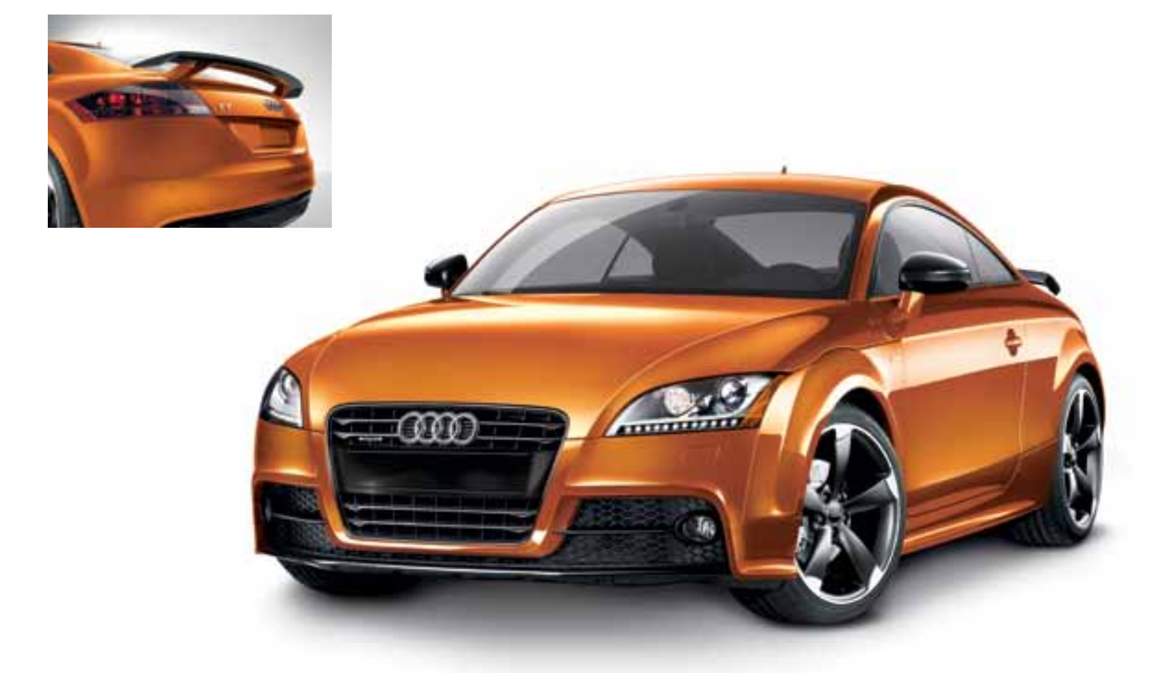
2013 Audi TT Coupe Prestige shown in Samoa Orange metallic with available Audi S line® Competition package.

Not that the Audi TT Coupe isn't already dressed to kill, but when you opt for the Audi S line® Competition package, you make a bold statement even bolder. The S line exterior features striking black optic elements, including a grille surround, side mirror housings, a fixed rear wing spoiler and a lower front spoiler splitter. Setting it apart even further are a black diffuser, black exhaust tips, and 19" 5-arm-rotor design wheels in matte black finish. Plenty to ensure you'll never have to wait at the door again.