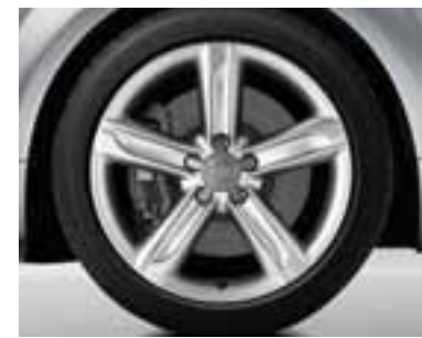
Premium Plus, Prestige (optional)