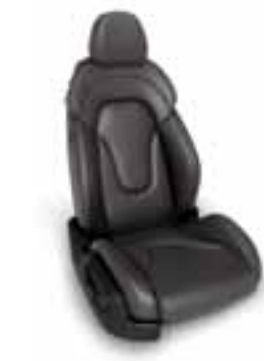
Titanium Gray leather/ Alcantara® Black leather Titanium Gray leather Luxor Beige leather Black leather/Alcantara® Madras Brown Baseball Black leather/ Magma Red leather Optic leather Perforated Alcantara® Black leather